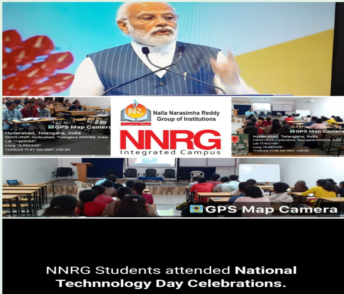
B. Pharmacy Final Years students attending National Technology Day celebration

A National Technology Day celebration was conducted for B. Pharmacy Final Years students through hybrid mode: The theme of National Technology Day 2023 is 'School to Startups- Igniting Young Minds to Innovate.' The day acts as a reminder of the country's technological advancements. "Science is a beautiful gift to humanity; we should not distort it." "Any sufficiently advanced technology is equivalent to magic." "One machine can do the work of fifty ordinary men. No machine can do the work of one extraordinary man." Coted by Shri Narendra Modi Prime Minister of India.