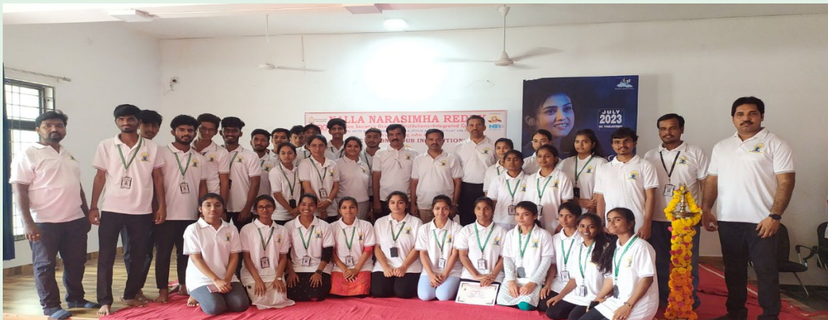
NNRG SOP have participated