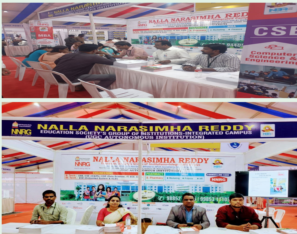
KAB Fair at nizam College grounds