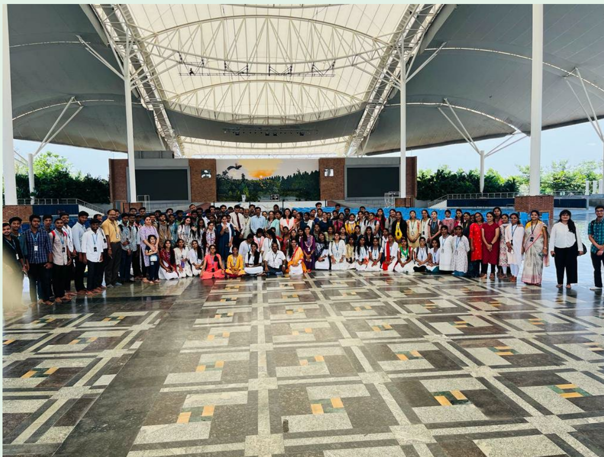
At KANHA SHANTHI VANAM